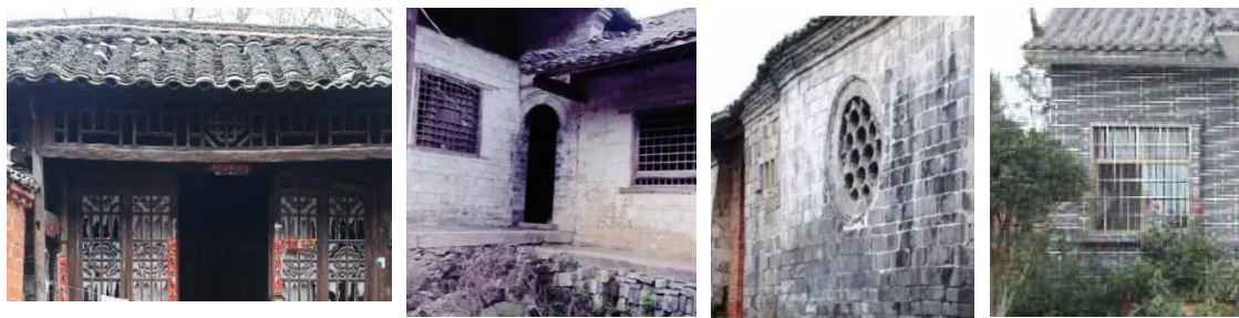
Figure 4: Opening Windows of Traditional Dwellings in Southern Henan Province