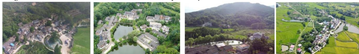
Figure 1: Traditional Villages in Southern Henan Province

According to research [9], starting from people's perception of factors affecting the healthy living environment, the rural healthy habitat environment can be divided into three parts: residential buildings themselves, living spaces, and social services. Among them, shaping healthy buildings through changes in living spaces and social services is a comprehensive process involving multiple parties and is a daunting and lengthy task. Meanwhile, the focus of residential buildings lies in creating a healthy indoor environment, mainly reflected in aspects such as air quality, light environment, architectural layout, and building materials. Therefore, optimizing the indoor environment through architectural design methods to create healthy spaces is more achievable.